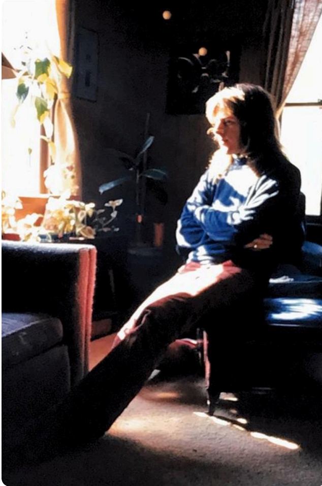
The Farm 1973